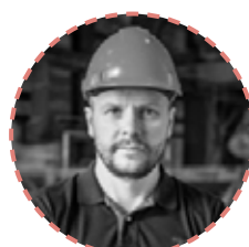
Michal Syc Institute of Chemical Process Fund. of CAS (CZ)