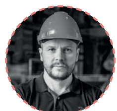
Michal Syc Institute of Chemical Process Fund. of CAS (CZ)